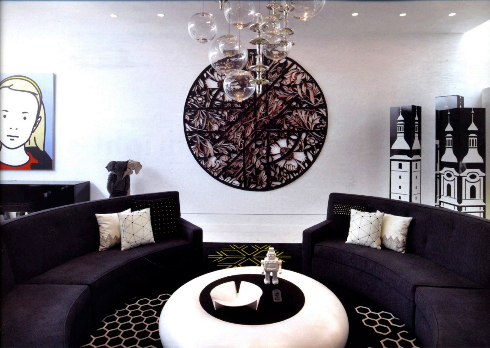
Clockwise from top: Viñas chose semi-circular sofas and a black palette for the living room to add a touch of sophistication; the taps in the boys' bathroom were designed by Arne Jacobsen and Vola; A guest bedroom dominated by green, a signature colour used by the decorator on each project.