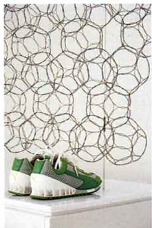
Left, from top: The master bathroom's new Thassos marble counter and existing Carrara marble floor. Original fire doors opening to the office, with its chaise by Nolen Niu. A steel wire screen above the office's credenza. The room's custom goat-hair rug. Right: The owner's custom bed is a stainless-steel platform suspended on steel cables. A partition surfaced in foil wall covering stands in lieu of a headboard.