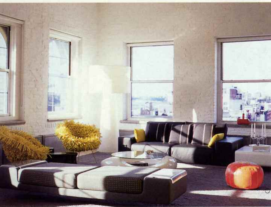
Previous spread: In the living area of a New York loft by Ghislaine Viñas Interior Design, a fiberglass cocktail table sits in front of a leather-covered sofa on a steel platform.