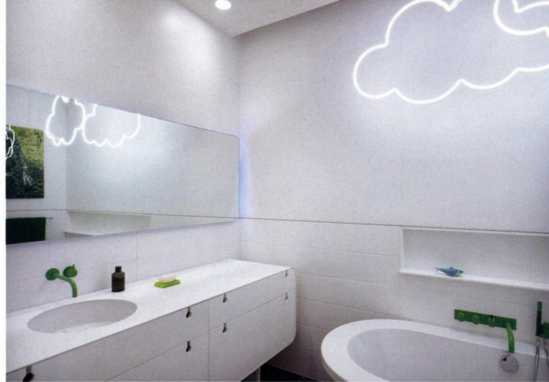
Clockwise from top: Custom neon clouds hover above the Sieger Design tub in the boys' bathroom. Ceramic tiles wrap the custom Corian sink in a powder room. Raw cedar lines the sauna designed by the house's builder, DDG Partners, for a space beneath the central staircase.

ARTQUITECT THROUGH URBAN ARCHITECTURE: SINK, VANITY (WALLPAPERED POWDER ROOM). IMM LIVING: PENDANT FIXTURES. ALPHA WORKSHOPS: CUSTOM WALLPAPER. MOOOI: PENDANT FIXTURES (BOYS' BATHROOM). THROUGH HOME DEPOT: SINKS. DURAVIT: URINAL. THROUGH PROPERTY: STOOL. IMAGINE TILE: FLOORING. FTF DESIGN STUDIO: CUSTOM TUB (MASTER BATH). DORNBRACHT: TUB FITTINGS, SINK FITTINGS. NELLA VETRINA ITALY: VANITIES. BROCADE HOME: MIRRORS. ARTEMIDE: SCONCES. THROUGH REWIRE: PENDANT FIXTURE. THROUGH C TO C TILE: FLOOR TILE. HOESCH: TUB (BOYS' BATHROOM). LITE BRITE NEON: CUSTOM PENDANT FIXTURE. EVANS & PAUL: CUSTOM SINK (TILED POWDER ROOM). USONA: PENDANT FIXTURES. WATERWORKS: TILE. THROUGHOUT RICHARD J. SHAVER ARCHITECTURAL LIGHTING: LIGHTING CONSULTANT. PLUS GROUP: MEP. FRITZMARTIN ELECTRIC: ELECTRICAL CONTRACTOR. B+G FULL CONSTRUCTION: FINISH CONTRACTOR.