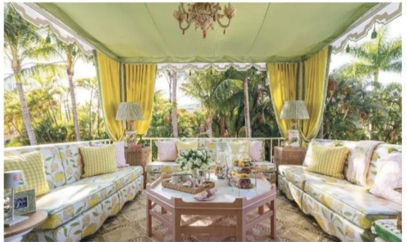
Florida- and Iowa-based designer Amanda Reynal conceived of a citrusy terrace off a bedroom on the second floor of the Kips Bay Decorator Show House Palm Beach using kiwi-hued and lemony fabrics with touches of pale pink.

Instagram: @modernluxuryinteriors ; @jessebratter