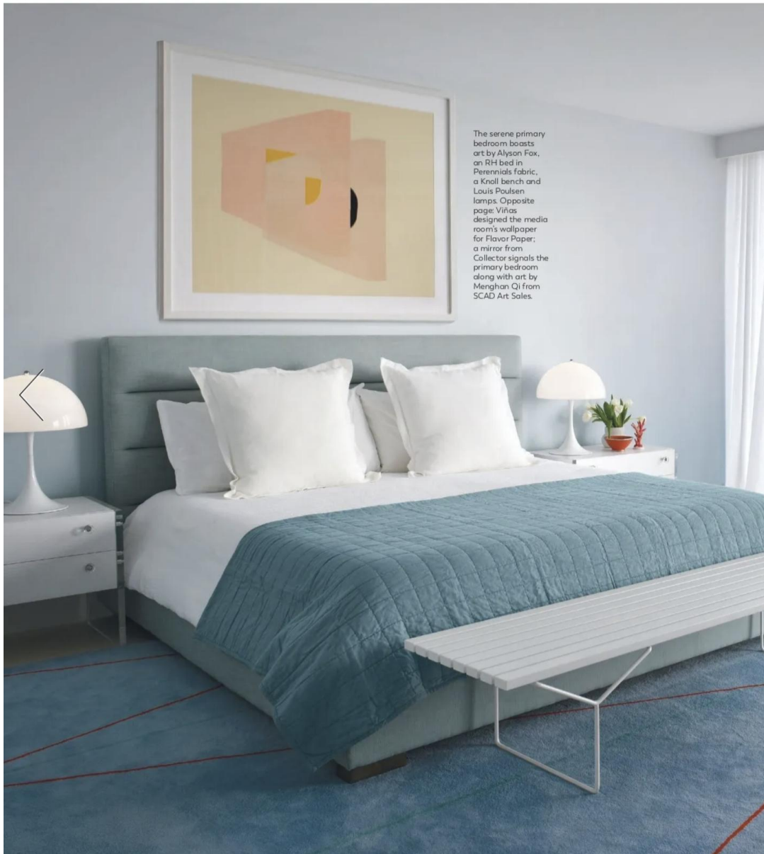
The serene primary bedroom boasts art by Alyson Fox, an RH bed in Perennials fabric, a Knoll bench and Louis Poulson lamps. Opposite page: Viñas designed the media room's wallpaper for Flavor Paper; a mirror from Collector signals the primary bedroom along with art by Menghan Qi from SCAD Art Sales.

the bedrooms and a sandy-hued, oversize palm print in the media room. To accommodate the owners and their two teenagers—and their penchant for entertaining friends and family après-beach—Viñas upholstered much of the seating with durable performance fabrics from her collection with HBF Textiles. In the primary bedroom, she incorporated gradient shades of blue and gray, drawing inspiration from the colors of the ocean and how they constantly change with the sun. “This couple loves color and they are attracted to enlivened interiors,” says Viñas, and she would know, since she’s designed