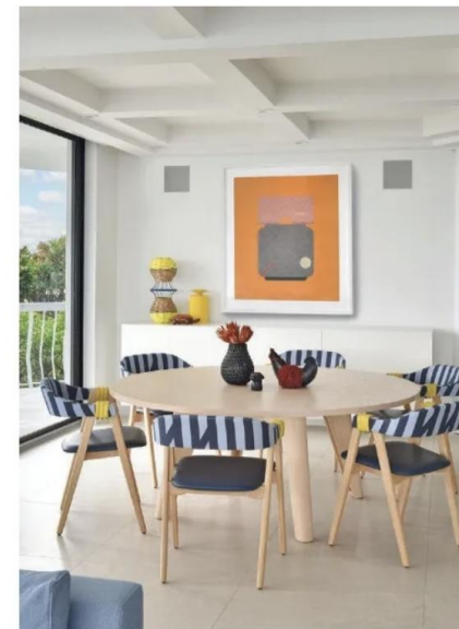
Clockwise from top left: HAY pillows top a Ligne Roset sofa in the living room alongside Bonacina 1889 poufs in KnollTextiles fabric; Moroso chairs with Sir Stripe-a-lot fabric by Ghislaine Viñas for HBF Textiles circle a dining table from Scandinavian Spaces beneath art by Alyson Fox from ArtStar; a PET Lamp Colombia joins a Ludwig Favre photo from ArtStar in the entry.