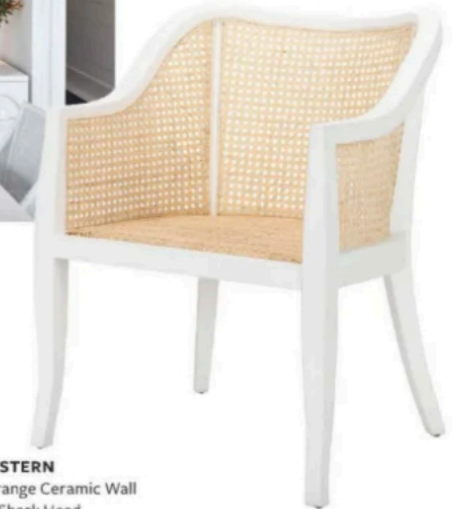
SAFAVIEH Maika Dining Chair www.safavieh.com