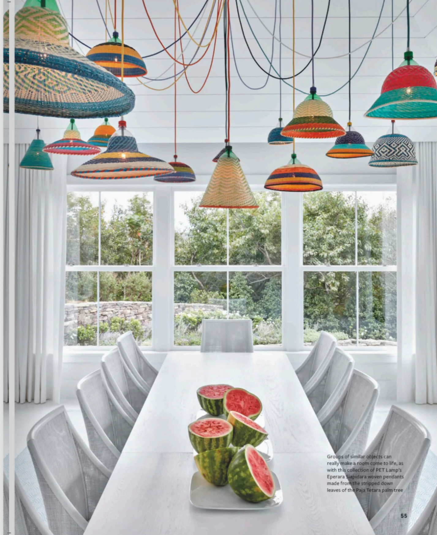
Groups of similar objects can really make a room come to life, as with this collection of PET Lamp's Eperara Siapidara woven pendants made from the stripped down leaves of the Paja Tetara palm tree