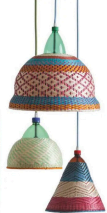
PET LAMP PET Lamp Eperara Siapidara www.petlamp.org