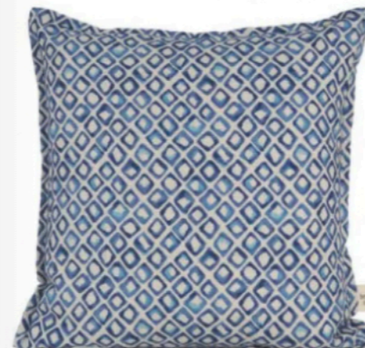
BETHIE TRICKS TEXTILES Riad Ink Scatter Cushion www.bethietricks.com