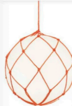
GLOBAL LIGHTING The Fisherman Pendant www.globallighting.com