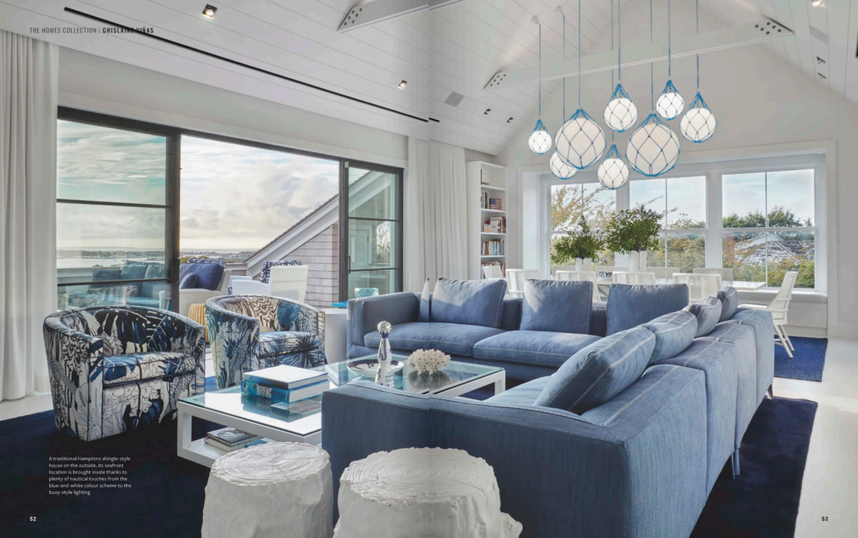
A traditional Hamptons shingle-style house on the outside, its seafront location is brought inside thanks to plenty of nautical touches from the blue-and-white colour scheme to the buoy-style lighting